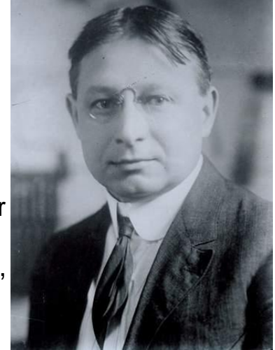
Ellis Parker Butler American Humorist and Author