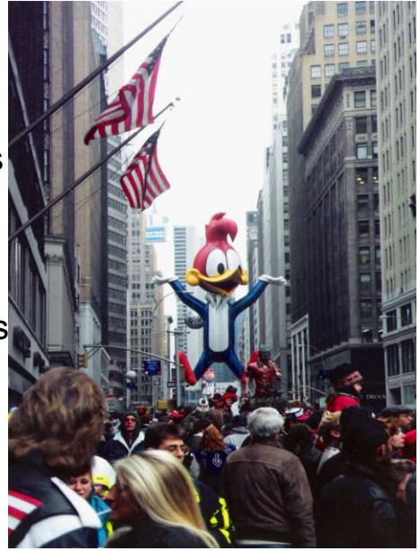
Woody Woodpecker 2004 Parade

In 1924, Macy's employees, many of whom were first-generation immigrants proud of their new country and their jobs, staged the very first parade to celebrate Christmas and draw attention to the store. The Macy's Christmas Parade, as it was called that first year, featured workers dressed as clowns, cowboys, and various other characters. There was one marching band. Horses pulled three floats depicting The Old Lady Who Lived in a Shoe, Little Miss Muffet, and Little Red Riding Hood. The store borrowed camels, donkeys, elephants, and goats from the Central Park Zoo and added them to the line-up. Santa Claus appeared gloriously at the end as he has done every year since.