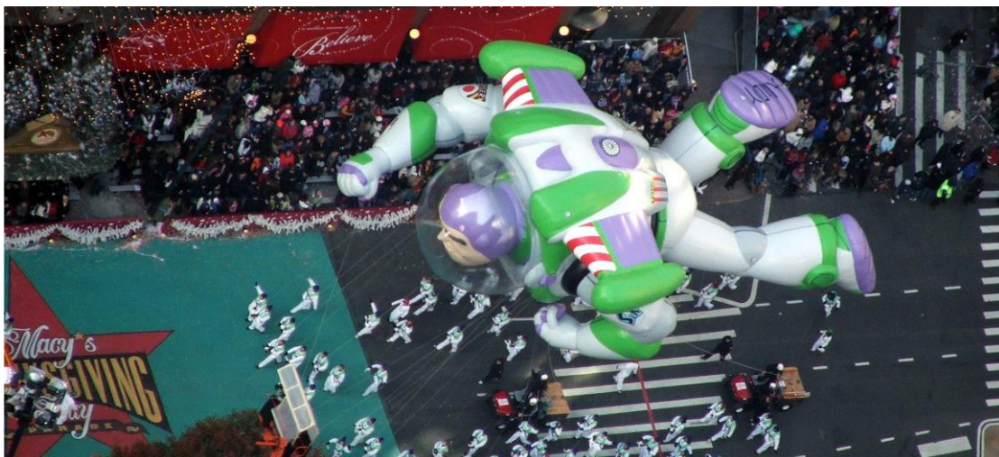
Macey's Thanksgiving Day Parade 2008 View from Empire State Building