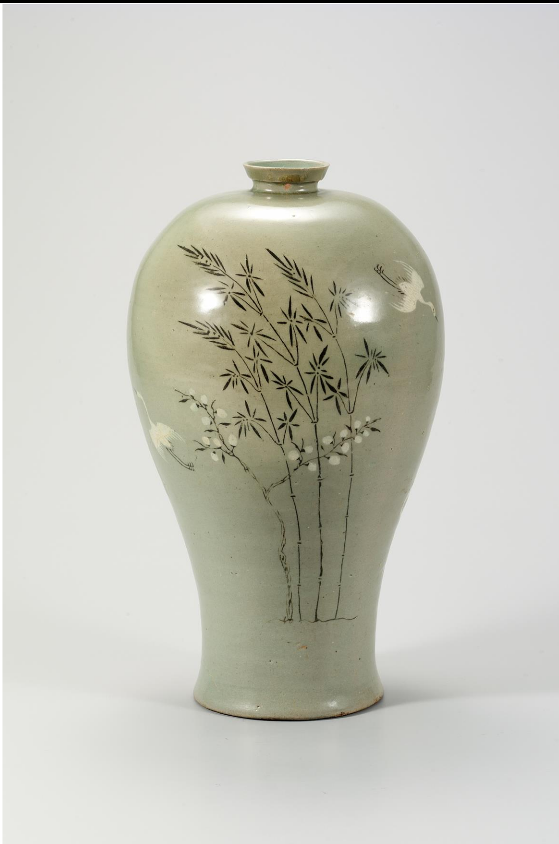
Celadon Prunus Vase with Inlaid Plum , Bamboo and Red-crowned crane Design

National Museum of Korea Image: Wikimedia Commons