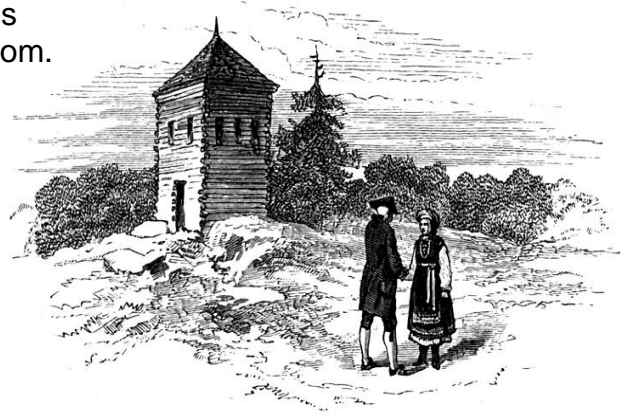
THE FIRST CHURCH IN PHILADELPHIA.

Within a year, a group of 13 German families left their native land in search of religious freedom. They laid out the village of Germantown, Pennsylvania near William Penn's Quaker colony. Other Germans followed and settled nearby. They built monastery-like villages where they lived simply and humbly. They tried out several concepts of communal living, including shared ownership of property and income and group upbringing of children. The Amish, Hutterites, and Mennonites are their descendants.