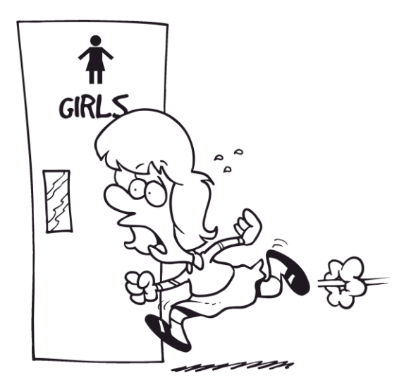
And There's a Boy in the Girls' Bathroom, (more than once).

Then there are black eyes, monsters from outer space, basketball, homework, a book report, a birthday party a new friendship,